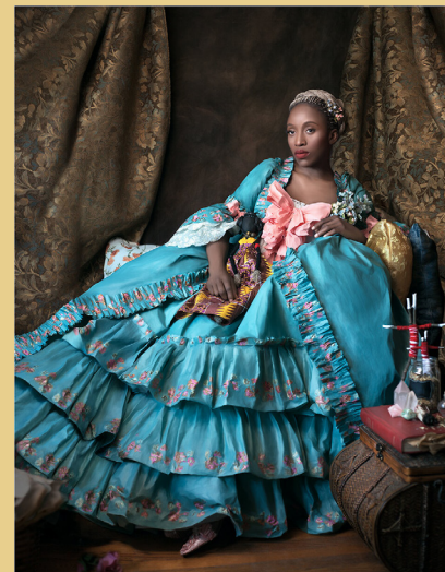
"Marie-Antoinette Is Dead" (2017) - Archival pigment print, 23 x 26 in