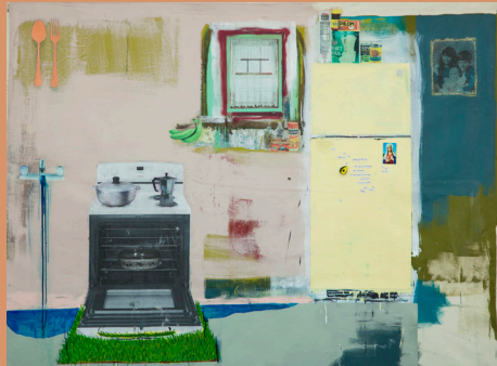
"Apt 9D (La Cocinita)" (2019) - Mixed media on canvas , 70 x 96 in

'La Cocinita' is part of the series Apt 9D which recreates a Nuyorican apartment through life-size painting collage. Objects commonly found in a Latinx home such as calderos, grecas, and a magnet of Jesus on the fridge reminds the diaspora of home. The absence of the figure makes us think about the displacement of longtime Black residents in El Barrio. This painting reveals our shared history.