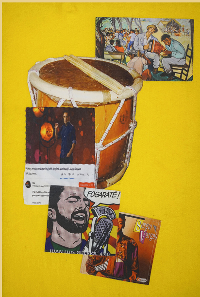
"Poetry, Music & Identity" (2018) - Digital print fabric, felt, cotton & foam, 36 x 24 in

The artist presents a loving homage to her father, a merengue musician, and by extension to the key role merengue music plays sustaining communities. The depiction of singer Juan Luis Guerra alludes to his wide popularization for Dominicans but for Latinx and Latin American communities across the hemisphere. The placing of the drum at the front of the image anchors the African roots of merengue, challenging the whitening campaigns to which rhythm was originally subjected to in the Dominican Republic.