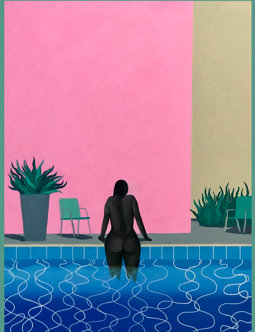
“What a Real Barbie Looks Like” (2018) - Acrylic on canvas, 36 x 48 in