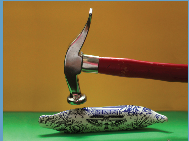
“De Verde a M'aduro” - from the series “El Negro Detrás de la Oreja” (2014) - Digital print, 18 x 24 in