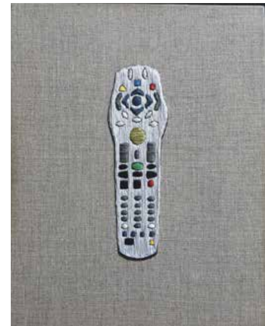
'Control' | My Underemployed Life series, 2019, Hand Embroidery on Linen, 11 x 14 in