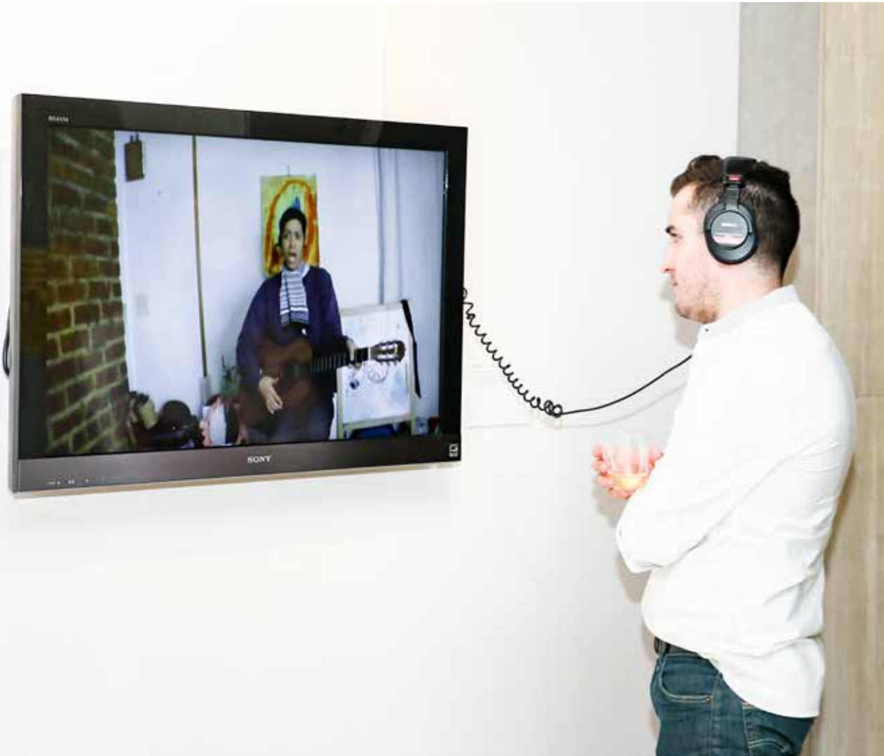
'Untitled (5 Speeches),' 2013, Single channel video, 9:00 minutes

This video acts both as performance and documentation. Grullón reenacts speeches witnessed and written on subway rides for over six months. Each tells a personal story about a person's situation and need to ask others for money.