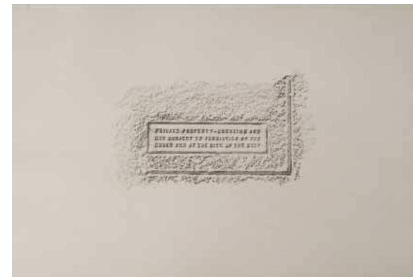
'Property Line, Park Ave. and 52nd St (Seagram Building),' 2008, graphite floor rubbing on paper, 18 x 24 in