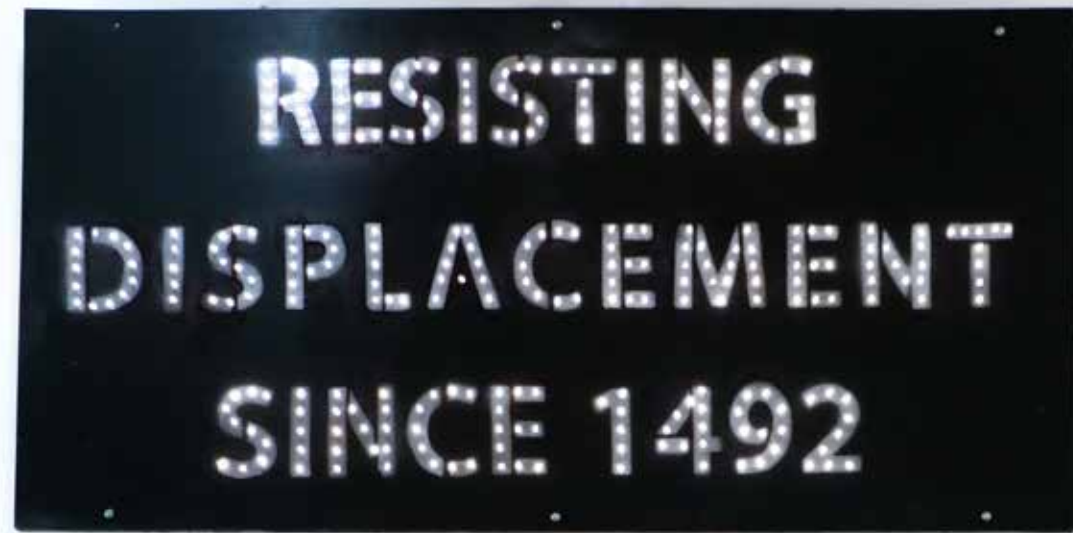
'Resisting Displacement Since 1492,' 2017, Light sign, black corrugated plastic sheet, strings of white xmas lights, washer screws, wooden panels, 24 x 48 in

This light sign was originally installed in 2017 in the storefront window of La Esperanza, a local Bushwick bodega owned by a Mexican family living in the neighborhood for almost 30 years. More than 40 light signs were built and distributed to NYC housing organizers and tenants through the 'Mi Casa No Es Su Casa: Illumination Against Gentrification' community workshops held at Mayday Space. They were created to protest the ongoing displacement of poor POC and migrant families in NYC.