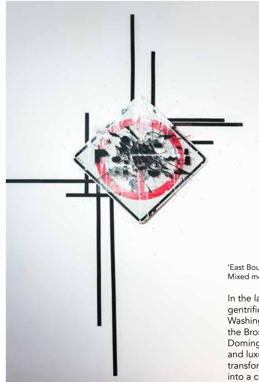
'East Bound Displacement,' 2018-2019, Mixed media, 30 x 30 in