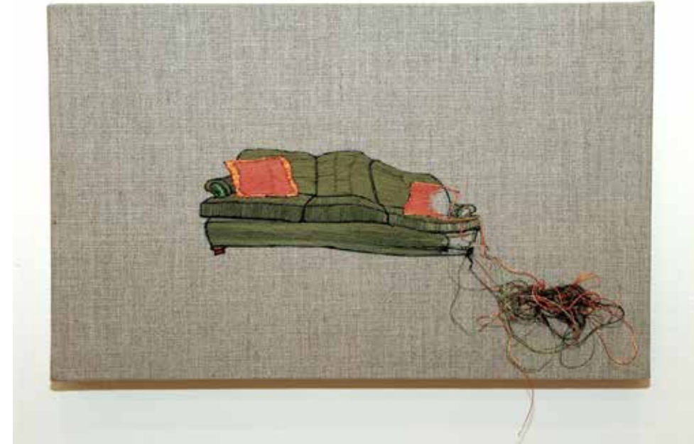
'Prone' | My Underemployed Life series, 2019, Hand Embroidery on Linen, 11 x 14 in