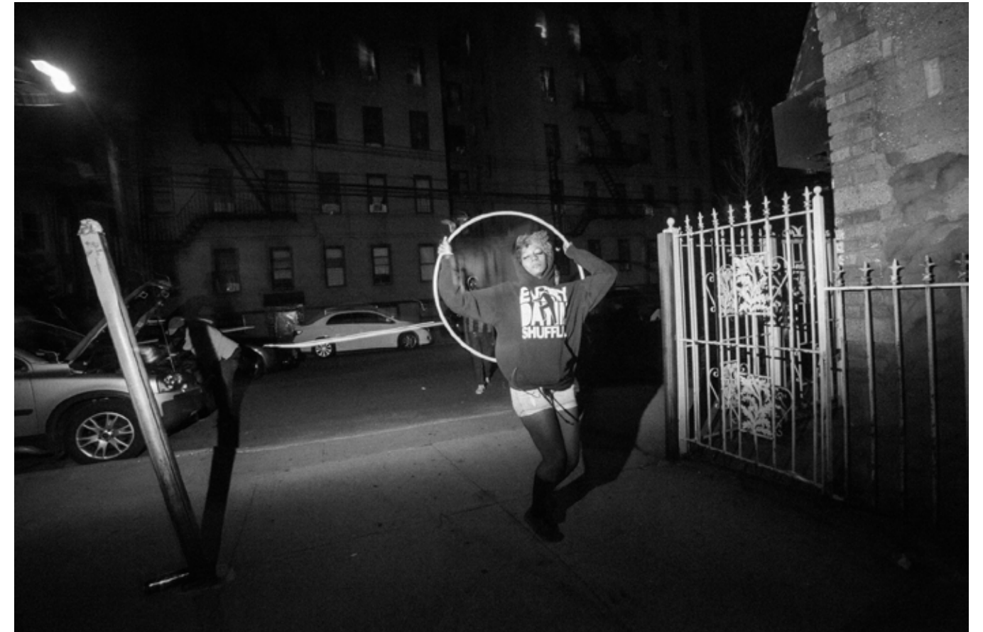
'Hydro Punk, Hula Hoop Girl,' 2017, Archival pigment print 17 x 24 in