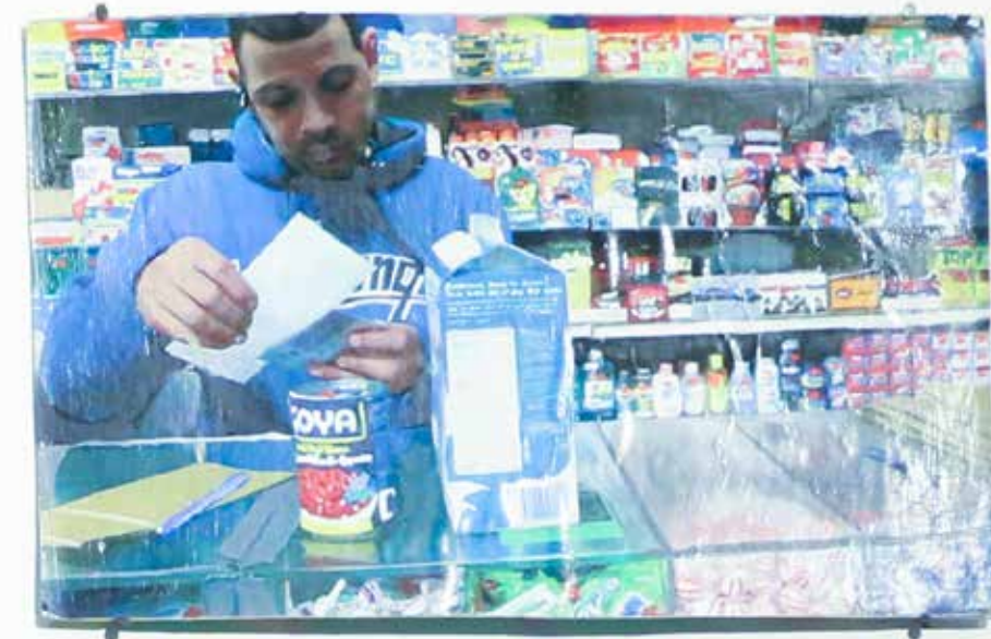
'We Take EBT,' 2010, Mixed media painting, found object, oil painting, digital print, cereal box cardboard, 12 x 8 in