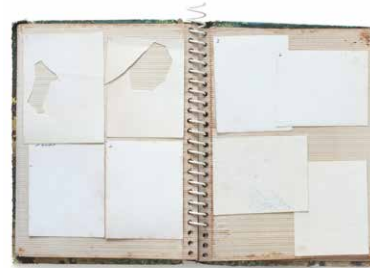
'Untitled (Photo Album),' 2014, Archival pigment print, 20 x 24 in

Milagros Altagracia Melendez Gross' bedroom bureau in Washington Heights, New York, NY.