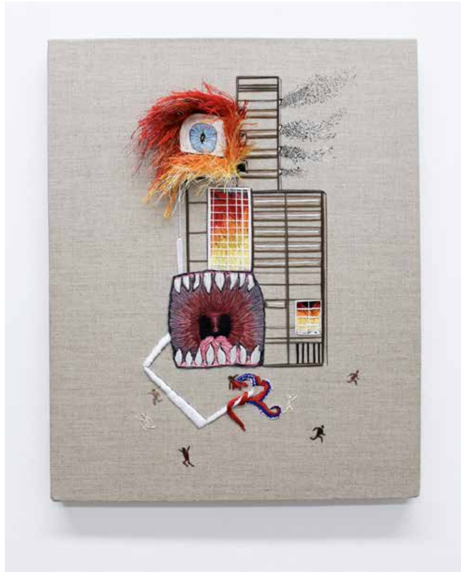
'The Bronx Housing Court Monster,' 2017, Hand Embroidery on Linen, 16 x 20 in