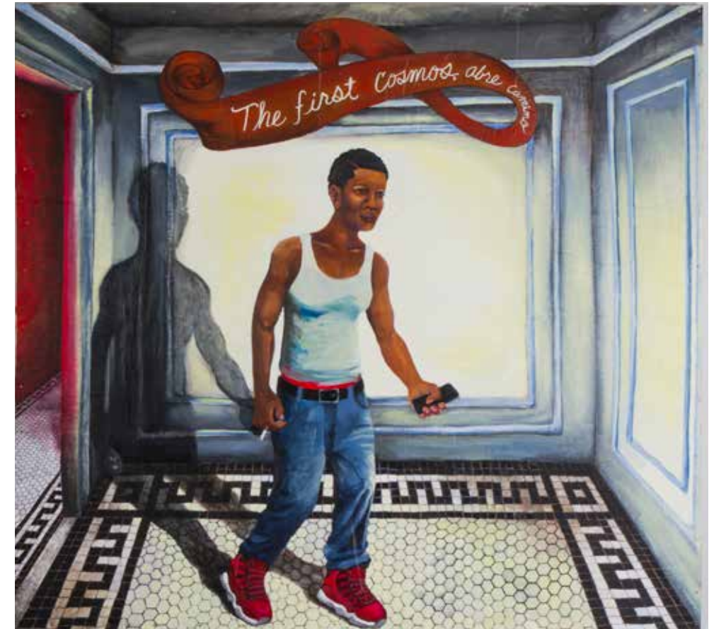
'Ex-Voto, The First Cosmos,' 2018, Acrylic on paper, cardboard, copper tacks on wooden frame, 70.5 x 77 in

An ex-voto is a votive offering to a saint or divinity. It is given in fulfillment of a vow or in gratitude or devotion. The Latin phrase 'Ex voto suscepto' translates to "from the vow made." This work is a sculpture as much as it is a painting in an attempt to address the materiality of ex-votos, usually painted on tin. The figure inhabits a typical interior space in old New York buildings, home to poor and working class people of color for many generations. French philosopher Gaston Bachelard refers to the home as "the first cosmos" in his book 'The Poetics of Space.' This metaphor emphasizes the importance of resisting displacement, as it becomes increasingly more difficult for communities of color to hold on to their cosmos. Lastly, the work pays homage to Elegua, the Orisha of the crossroads who traditionally sits at the threshold of the home, guarding the entry. It asks the Orisha to "illuminate the path" or to abre camino and to fill our cosmos with guidance and protection.